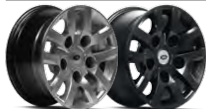
1948 DEFEND WHEEL - SET OF 4 Available in 8x16"