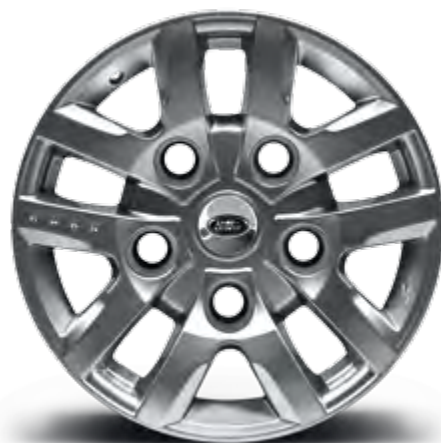
1948 DEFEND WHEEL SPECIFICATIONS