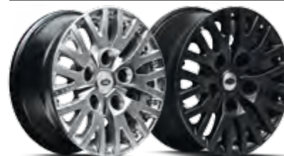
1983 RS DEFEND WHEEL - SET OF 4 Available in 8x18"