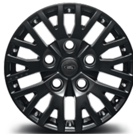
1983 RS DEFEND WHEEL SPECIFICATIONS