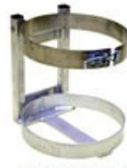
Single Gas Holder HNUN06