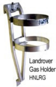
Landrover Gas Holder HNLRG