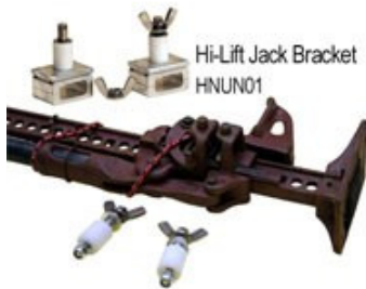
Hi-Lift Jack Bracket HNUN01