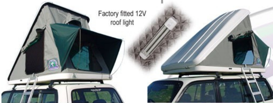
Factory fitted 12V roof light

The new Impi can be fitted to any vehicle with most roof bar or rack systems, from a sedan to the serious off-road vehicle. The Impi is a sleek, aerodynamic roof tent and will accommodate 2 people. This tent can be opened and ready for use in seconds. The Impi is fitted with the same 70mm high-density foam mattress and aluminium ladder with foot friendly flat tread profile that is used in our Canvas range. Unique to the Impi is the awning over the rear entry and screened vent. The roof of the Impi is also lined with an insulating and anti-condensation lining.