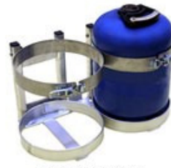
Double Gas Holder HNUN07