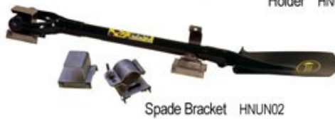
Spade Bracket HNUN02