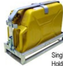
Single Jerrycan Holder HNUN09