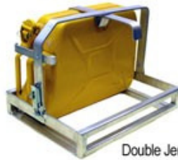
Double Jerrycan Holder HNUN10