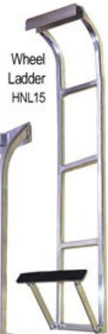
Wheel Ladder HNL15