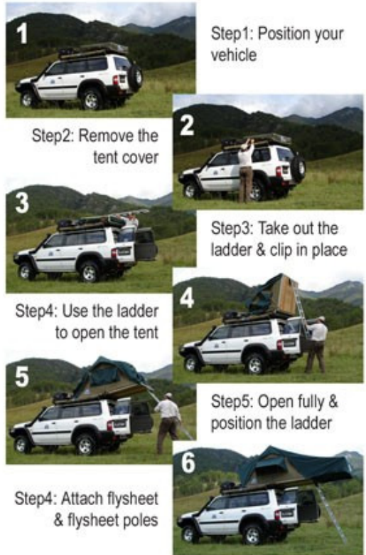
1 Step1: Position your vehicle