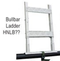
Bullbar Ladder HNLB??